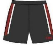
PE SHORTS BOYS