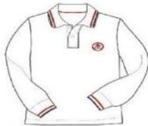
LONG SLEEVE POLO T-SHIRT