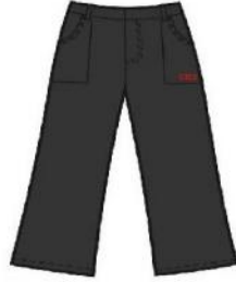
GREY TROUSERS GIRLS