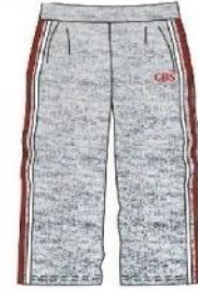
PE PANTS GIRLS