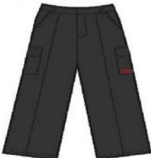
GREY CARGO TRS. BOYS