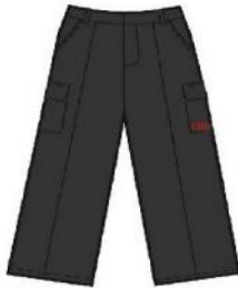
GREY CARGO TRS. BOYS