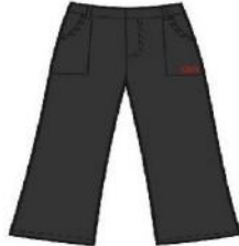
GREY TROUSERS GIRLS