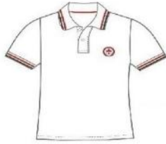
SHORT SLEEVE POLO T-SHIRT